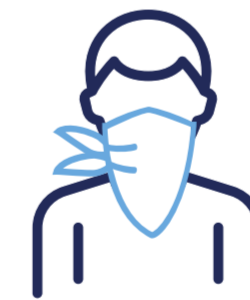
Bandana or a tightly woven fabric