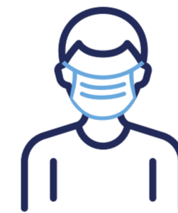
Face covering made of paper or a tightly woven fabric