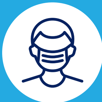
Wear a mask (if less than 2 metres)