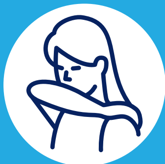
Sneeze into your elbow