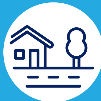
Limit your travel